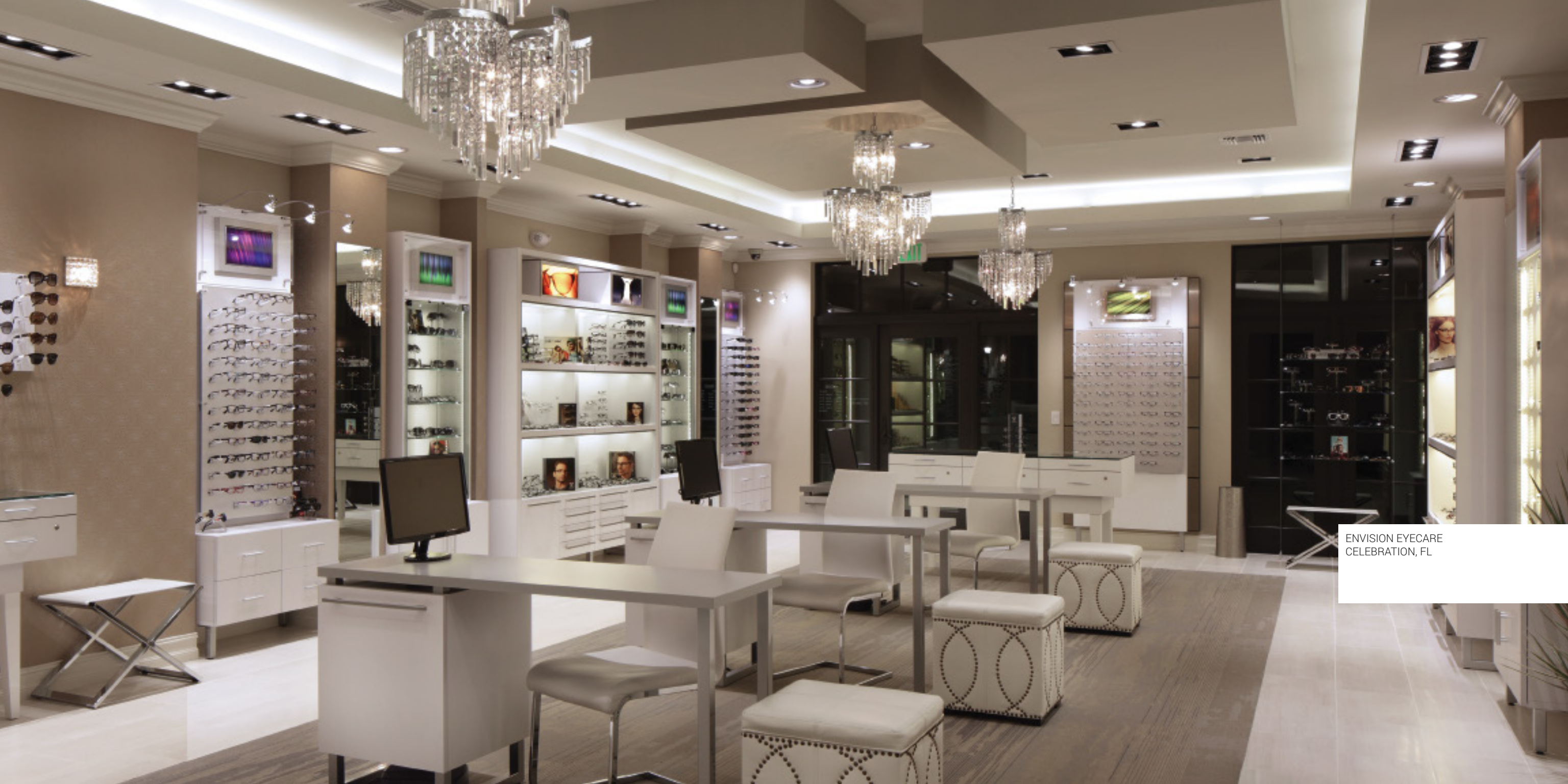
ENVISION EYECARE CELEBRATION, FL