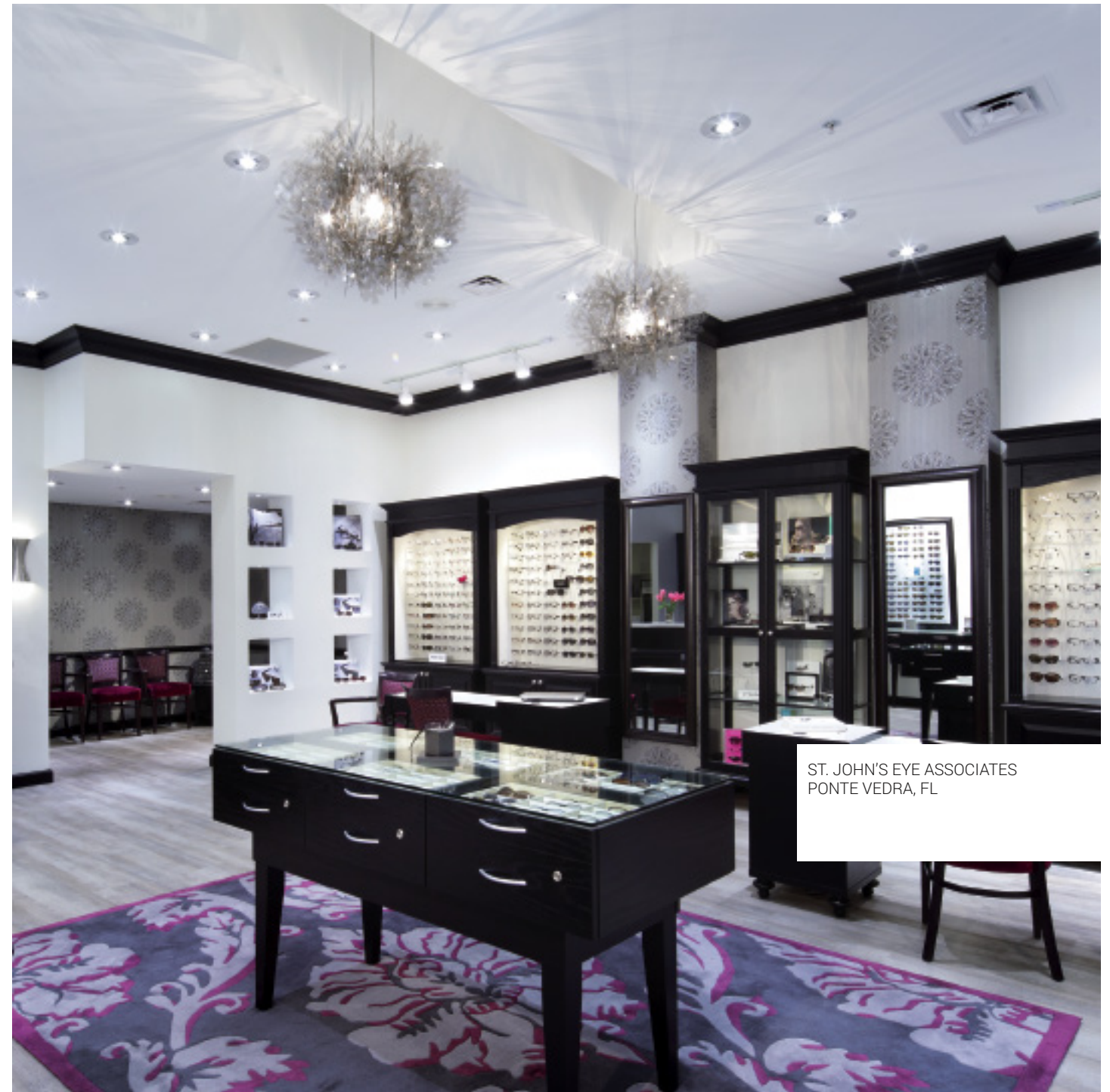
ST. JOHN'S EYE ASSOCIATES PONTE VEDRA, FL